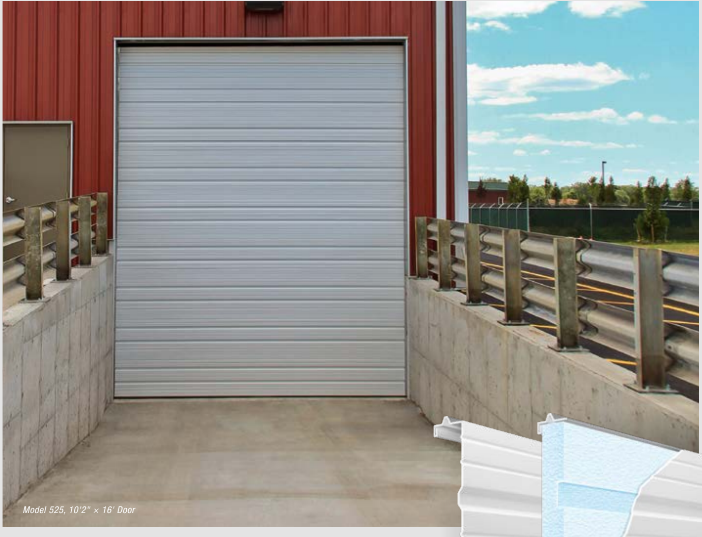
Model 525, 10'2" x 16' Door