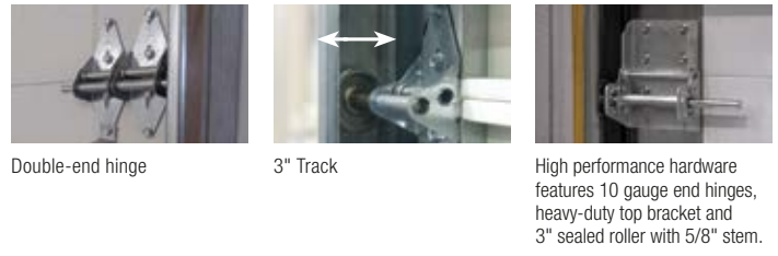
Double-end hinge 3" Track High performance hardware features 10 gauge end hinges, heavy-duty top bracket and 3" sealed roller with 5/8" stem.