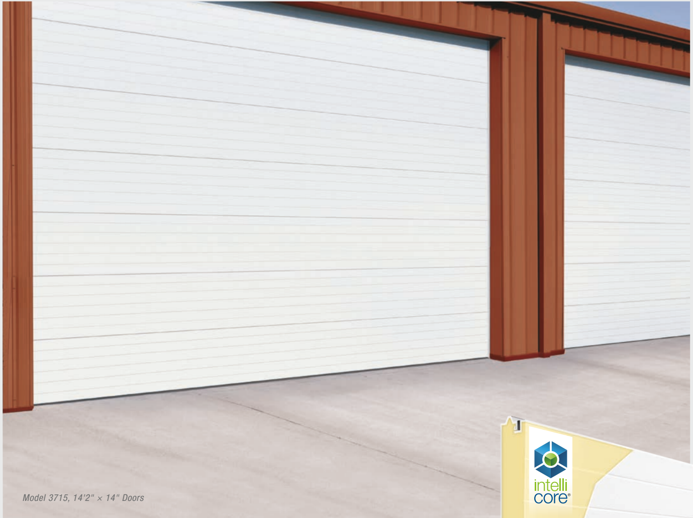
Model 3715, 14'2" x 14" Doors