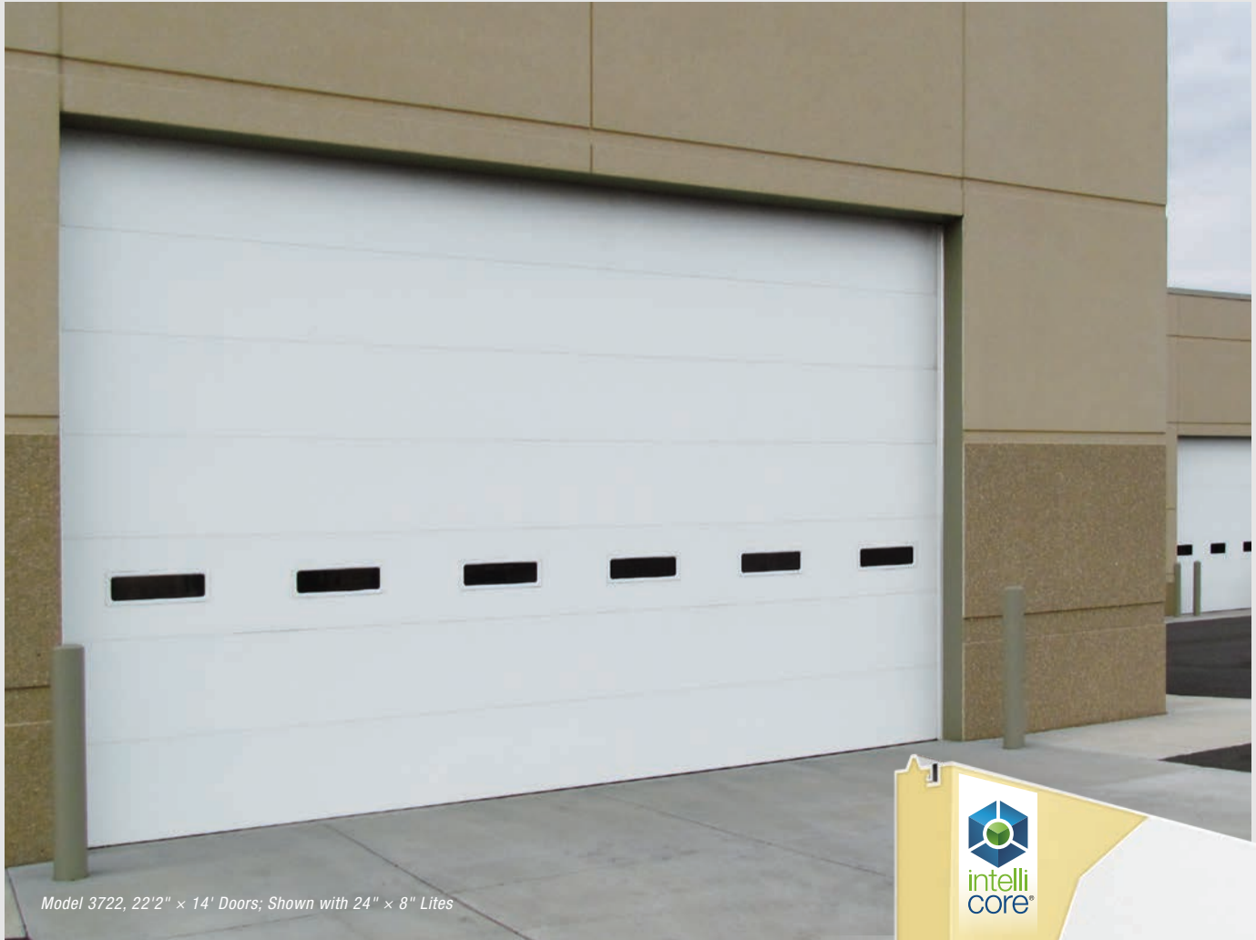
Model 3722, 22'2" x 14' Doors; Shown with 24" x 8" Lites